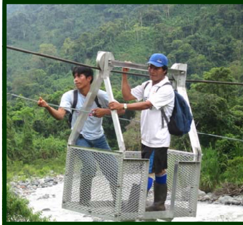
Young Cabécar men use the new cage to cross the river with ease.