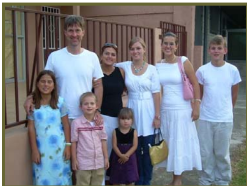
"The righteous man leads a blameless life; blessed are his children after him." Pr 20:7

"Jehova" to reflect the awesome name Yaweh that set the God of the Bible apart from all other gods and their respective names. He decided that even though a Jew would never mention that name, they nevertheless pronounced it in their mental process when they saw it written. By using this name, Reina accurately reflected the powerful message of the Old Testament about this god, and his image, Jesus Christ. And we have seen his name and person transform many people who read the Bible we are translating.