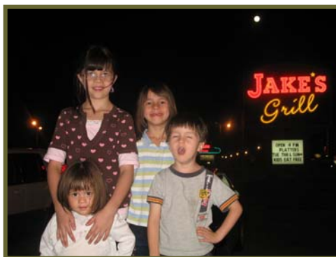
The kids enjoy a sign with their brother's name on the roadside.

This woman did "what she could." Are we doing what we can for Him? Are we giving out of our abundance or are we giving all we have to live on? Because just when we are scraping bottom, He comes and pours it all back on us in a display of affirmation that leaves us feeling like we've done nothing to deserve such love.